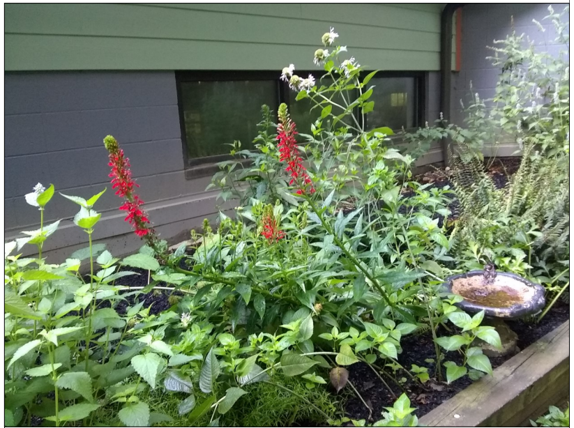
A renewed native plant berm around the Norma Hoffman Visitor Center.