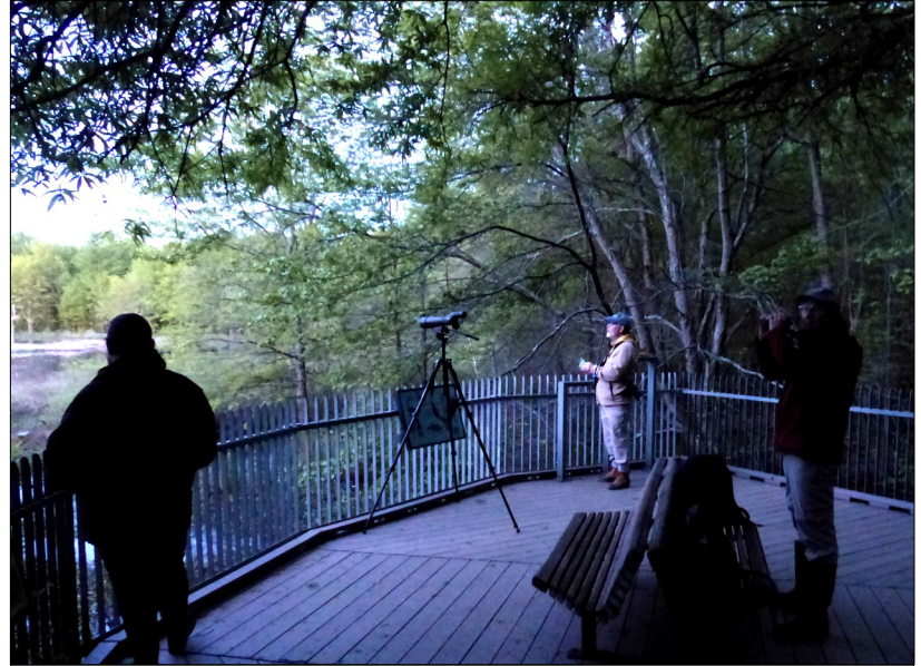
Bird-a-thon Beyond! participants practiced social distancing at HMP while observing various bird species.

Thanks to all of those who contributed financially as part of Bird-a-thon Beyond! You helped us fund our 2020 Natural Resource Management Intern.