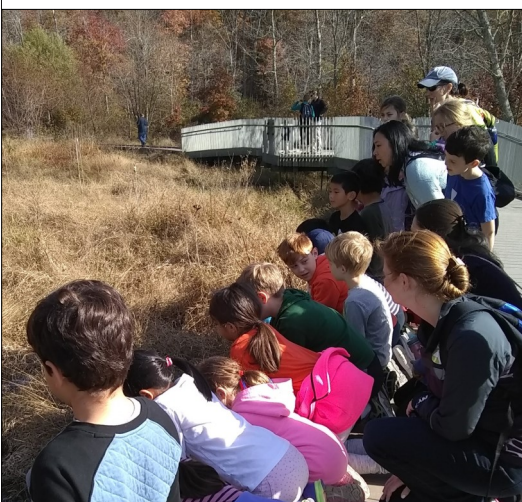
School children observing exciting animals in the wetland.

Visitors, virtual and live, received an enhanced experience from items purchased by Friends that support naturalist-led programs.